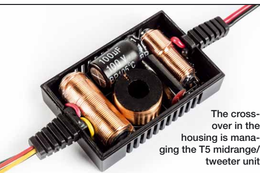
The crossover in the housing is managing the T5 midrange/tweeter unit

speaker. The Eton kit therefore comes with a ready-made midrange/tweeter unit consisting of a small 2-inch midrange speaker with paper cone and a .7-inch tweeter dome. There is also an external crossover to cross tweeter and midrange speakers. The 8-inch woofer is conveniently fitted with its own 12-dB crossover, which, like all components, has the matching VW connectors.