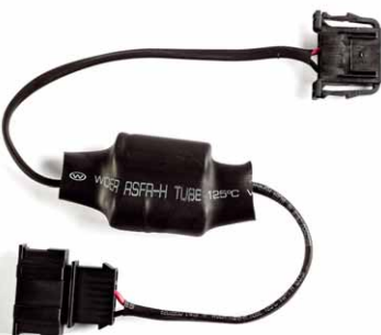
In the T5, the woofer needs this low pass crossover

In the measuring laboratory there is primarily good news from the two systems. The 8" woofer is doing very well in both kits and scores with a very good frequency curve and little distortion. Due to the very good tweeter, the two-way system for the T6 is in no way inferior to the three-way model in the T5. From a metrological point of view, it is even ahead of it, because the midrange speaker of the T5 system is the limiting factor at higher volumes. With respect to sound, both systems offer plenty of bass. The 8" model plays in a superior and powerful manner, while also the bass reproduction is remarkably clean. The three-way system shows pretty details in the high-pitch range and scores with a beautifully dynamic performance. Snare drums, for example, come into your ear with a crisp sound. But the two-way system also has its advantages. With the great tweeter, it also delivers a carefully elaborated high frequency with