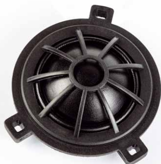
In the T6, a nice fabric tweeter is used, the space being sufficient for an extra-large 1.1-inch dome