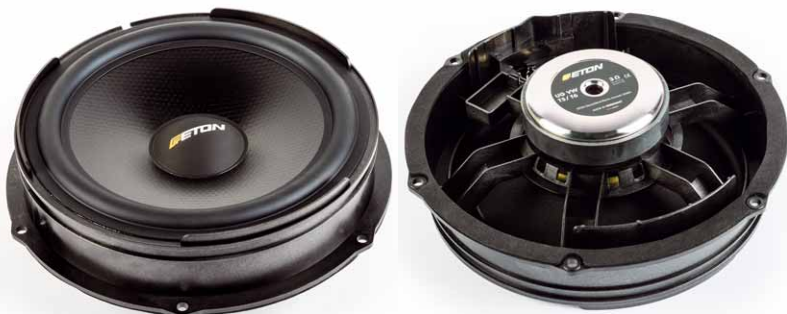
The woofer fits in both the T5 and the T6, operating as a mere woofer in the T5, whereas it runs as a two way midwoofer in the T6

in common the 8-inch woofer with a cast-on VW mounting flange and a VW plug connector. It is a typical Eton woofer with a glass fiber/paper composite cone, which is a close relative of the 8-inch lower midwoofer from Eton's universal POW components. The cone is shut off by a rubber dust cap and the motor uses a 1-inch voice coil. In the two-way system for the T6, the 8-inch model runs as a lower midwoofer without any crossover. Obviously, there was ample tweeter place in the T6, thus Eton equipped the T6-compo with a fabric tweeter, which as a special feature has an extra-large 1.1-inch fabric dome. This plus of cone area is a significant improvement over the standard of 1 inch, promising superior sound in the midrange. The upgrade solution for the T5 is considerably more complex. It has mounting holes on the outside of the dashboard for accommodating a midrange