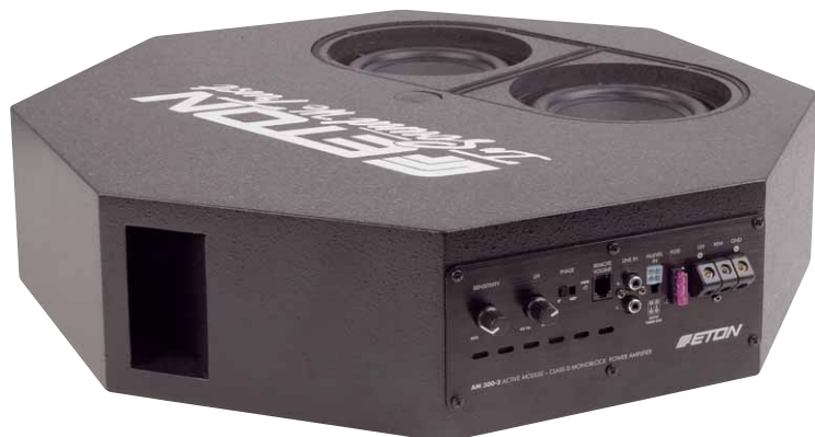
The vented housing is only 5" high and therefore suitable for emergency wheel trays