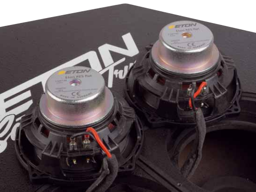
Two elaborately crafted 6" drivers with neodymium motor ensure the SPL

attachment to the spare wheel mandrel was taken over from the RES 10 A, for which a very solidly made tunnel passes through the housing in the middle. It is provided with a rubber stopper on top to make it look good. The extremely solid MDF housing is a perfect octagon and is covered with a black, impact-